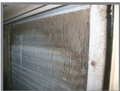
Mold & bacteria on a filter

Moisture build up in air-conditioning AHUs is inevitable. With Asia's humid environment and condensation issues, we quickly see why our cooling systems provide the perfect environment for mold and bacteria to grow. If these mold or bacteria grow on the exterior parts of the system, they can be cleaned away. But what about all the bacteria we can't see?