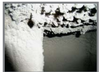
Mold & bacteria in a duct