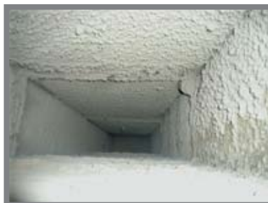
Mold & bacteria in a duct