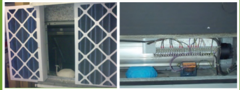
Gelair installed in the AHU of an air-conditioning system